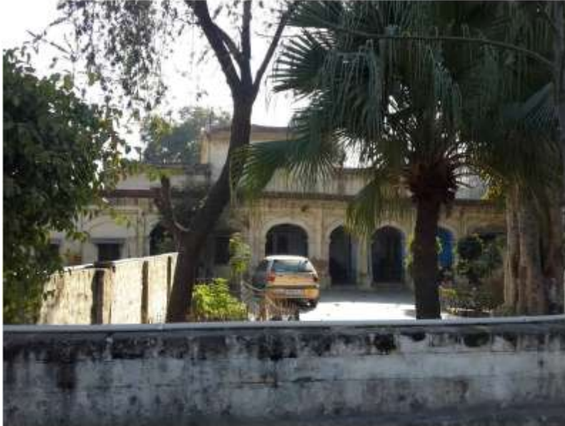
Figure 2 Approach Road