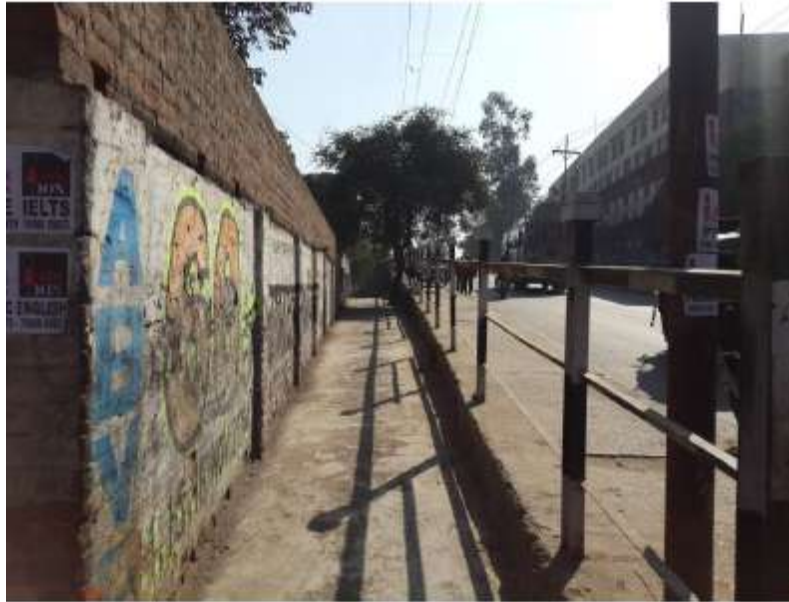
Figure 4: Rear View of property